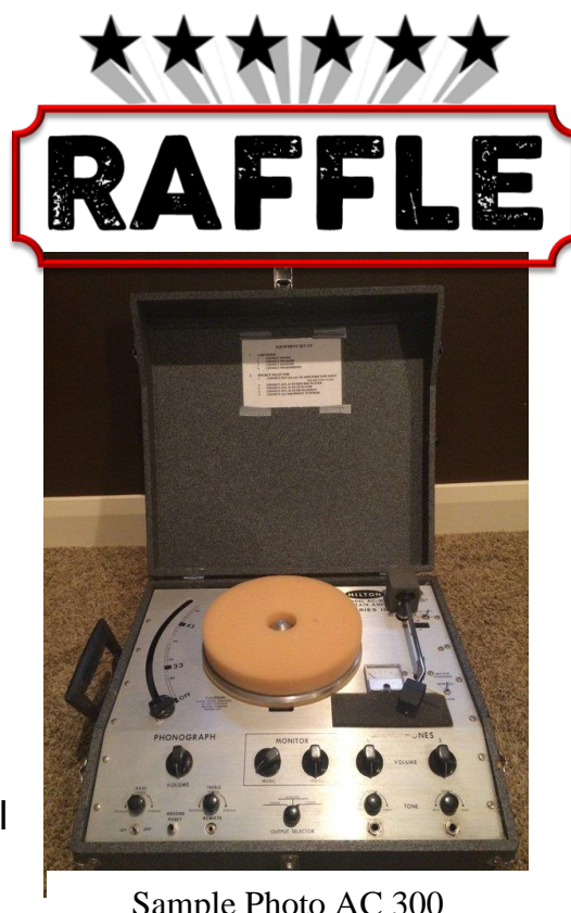
Sample Photo AC 300